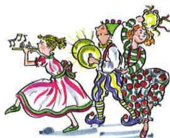
carnival costumes full of vivid colours