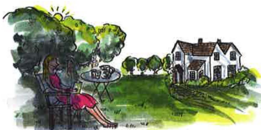
a shady corner of the garden