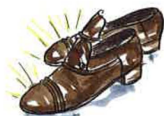
shiny leather shoes