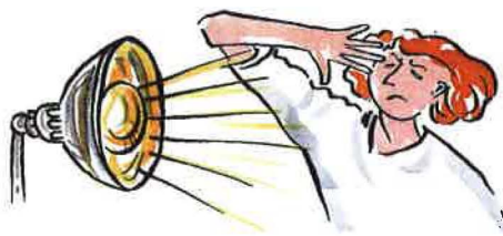
a dazzling light

You wear such dull colours – why don't you start wearing bright colours for a change? The light's too dim to read in here. We need another lamp. I wear sunglasses when I drive because of the glare of the sun.